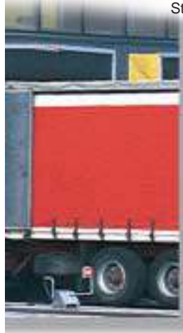
Standard Dock Shelter for narrow vehicles